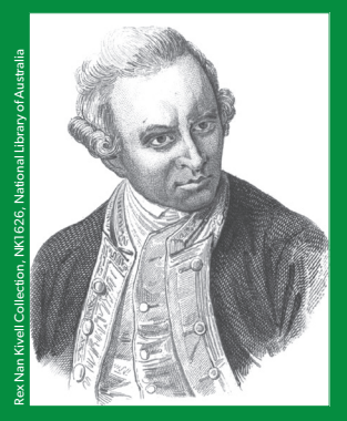
Captain James Cook

Tasman came to New Zealand in 1642, Captain Cook came to New Zealand in 1769. New Zealand was not settled by the British until the early 1800s, and Te Tiriti o Waitangi/The Treaty of Waitangi was not signed until 1840.